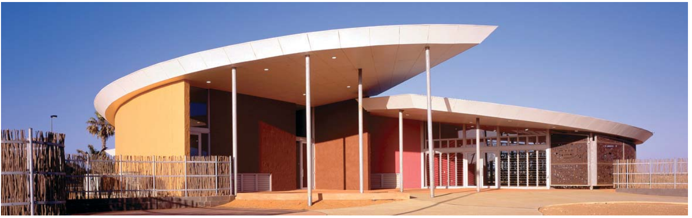
Above: The Gascoyne Aboriginal Heritage and Cultural Centre.