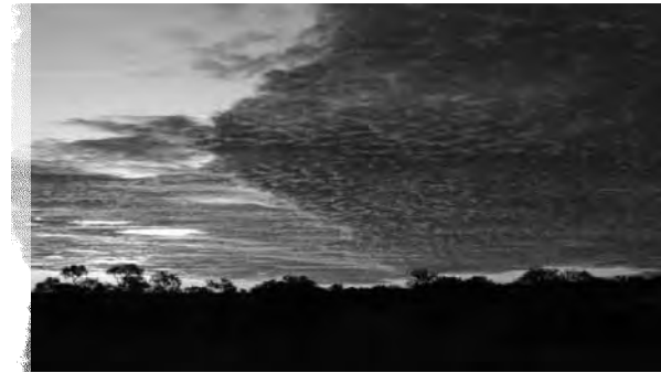
Gobawarra Minduarra Yinhawangka country.