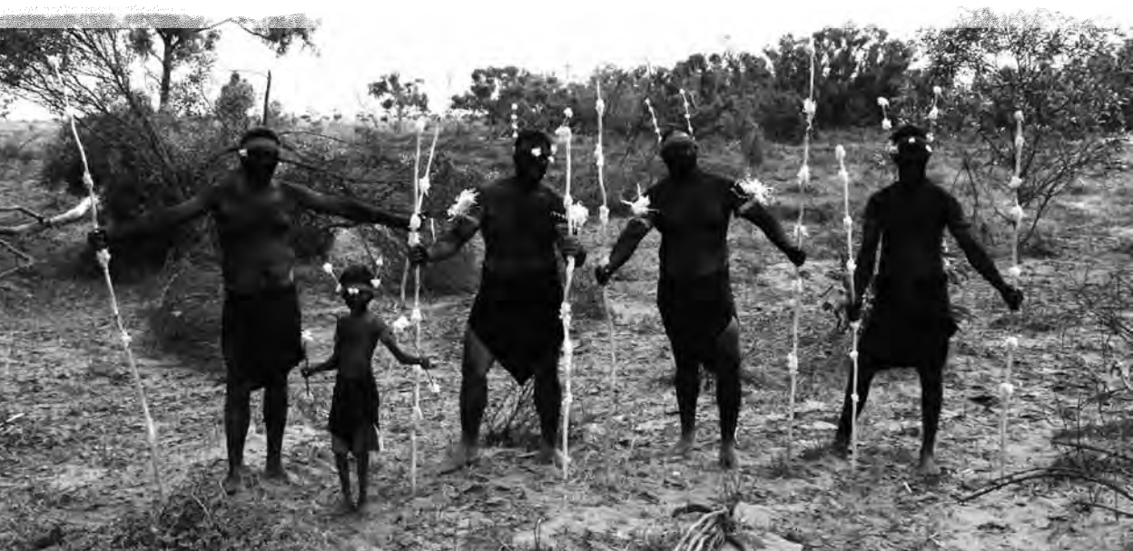
Ngarla dancers celebrate on their country.